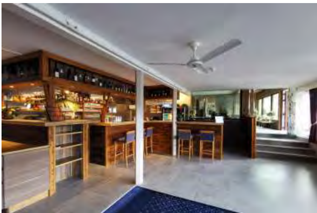
Get an espresso from the bar, or a cocktail. We have more than 100 different drinks on the menu.