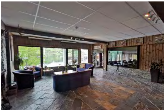
The lobby with stunning view on the fjord. relax while looking at a living painting.