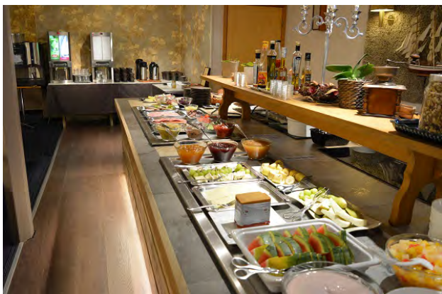
Breakfast: Intercontinental, croissants, fish, cheese, meat, fruit, cereals, glutenfree and home pressed apple juice, hot drinks. Lunch: either lunch package to go, or self served at the old buffet, cold salads, spreads, bread, hot soup, cold + hot drinks.