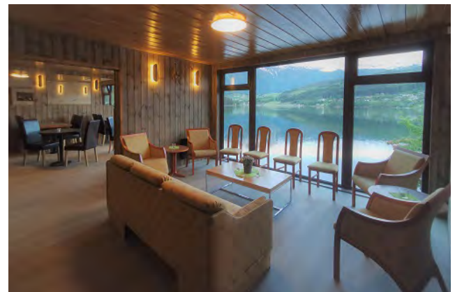
In the lounge you can spend your evenings playing board games or watching TV, while enjoying a beverage of your choice.