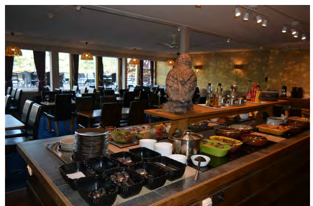
Diner: 3 course served at the table with, again, the stunning view on the fjord. Drinks not included.