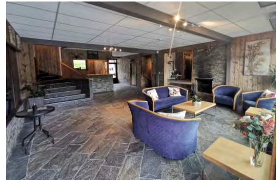
Chill in the reception area with an après-ski "Glühwein", or a Belgian beer, local cider or wine.